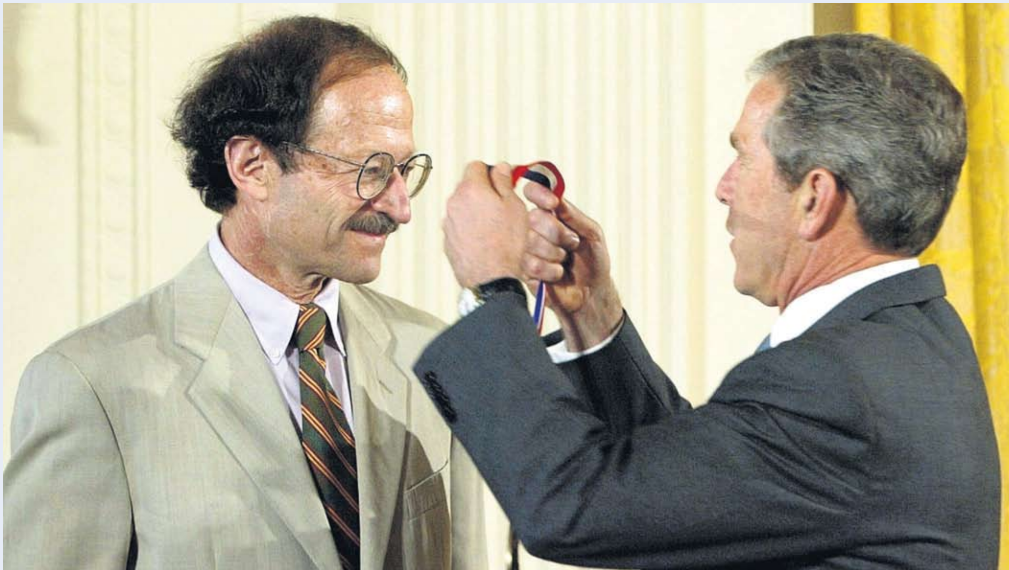
Harold Varmus receives the National Medal of Science in 2002; as the former head of the National Institute of Health, Varmus watched with dismay as George W Bush mangled science policy.

One of those 20 was Harold Varmus, who had served as director of the National Institute of Health (NIH) for most of the Clinton administration, and thereafter as director of the Memorial Sloan-Kettering Cancer Center in New York City, one of the world's leading institutions in its field. Given his past position, Varmus watched the Bush administration mangle science policy and hamstringing research with perhaps even more dismay than most. He wrote his new memoir, The Art and Politics of Science , partly in the hope that the story of his experiences in science, policy and the intersection of the two would be of use to whoever would guide the nation after the 2008 presidential election. Now it certainly will: on December 20, 2008, Barack Obama announced the appointment of Varmus, who had advised him during the election campaign, as co-chair