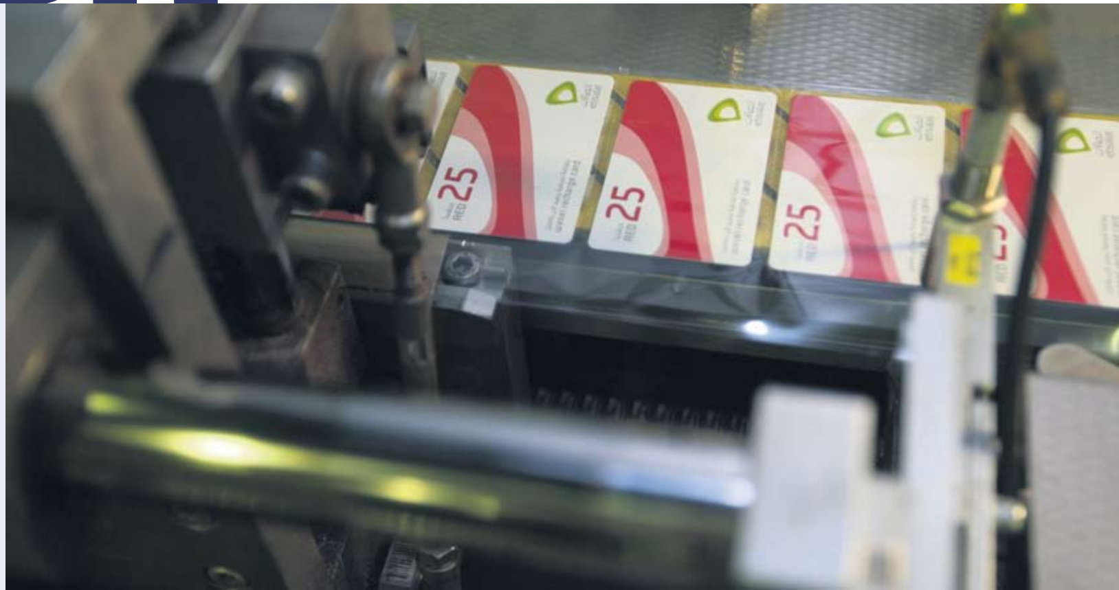
Every hour, more than 20,000 Etisalat recharge cards are printed out then wrapped in clear plastic by (what else?) the WrapMaster 100.

Scammers used to buy recharge cards, then instead of scratching away the silver film, put the card under an ultraviolet light that let them read the number under-