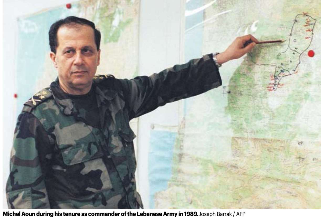
Michel Aoun during his tenure as commander of the Lebanese Army in 1989.

The Lebanese have embraced the trappings of western-style campaigning with such vigour and fluency that it is easy to forget that this is largely uncharted territory