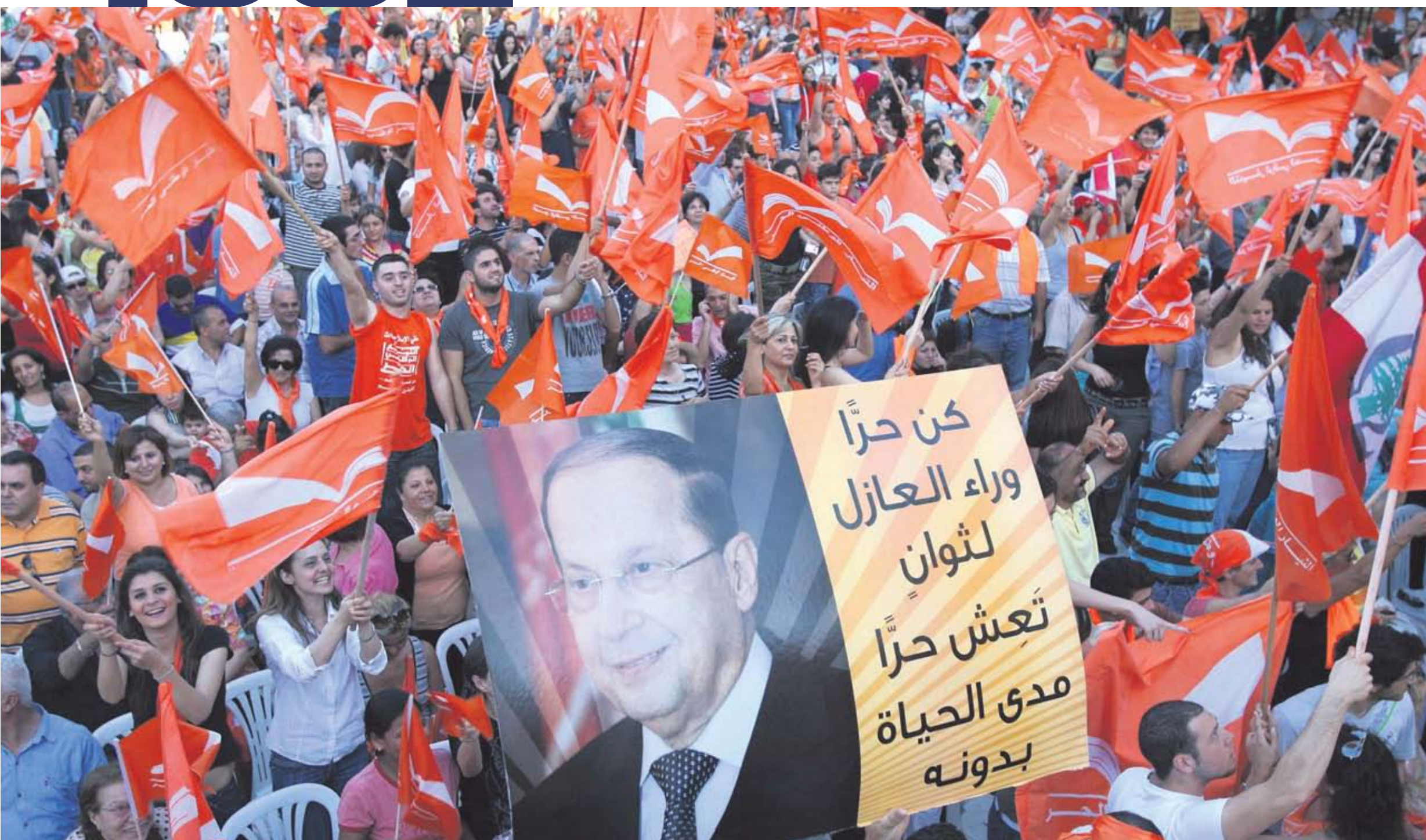
An FPM rally in Beirut on May 28: "Listening to the Aounists it remains hard to determine whether their fervent wish is for a new Christian strongman in the form of Michel Aoun or for the secularist agenda that he espouses."

reconstruction efforts and enabling the rise of a powerful prime minister in Rafik Hariri. Lebanon's apparent economic revival led many to conclude that Syrian tutelage was an acceptable price to pay for stability; as such, the FPM – with its message of implacable opposition to Syria – had little tangible presence in Lebanese politics and no international profile, even as the movement became increasingly organised and attracted growing support.