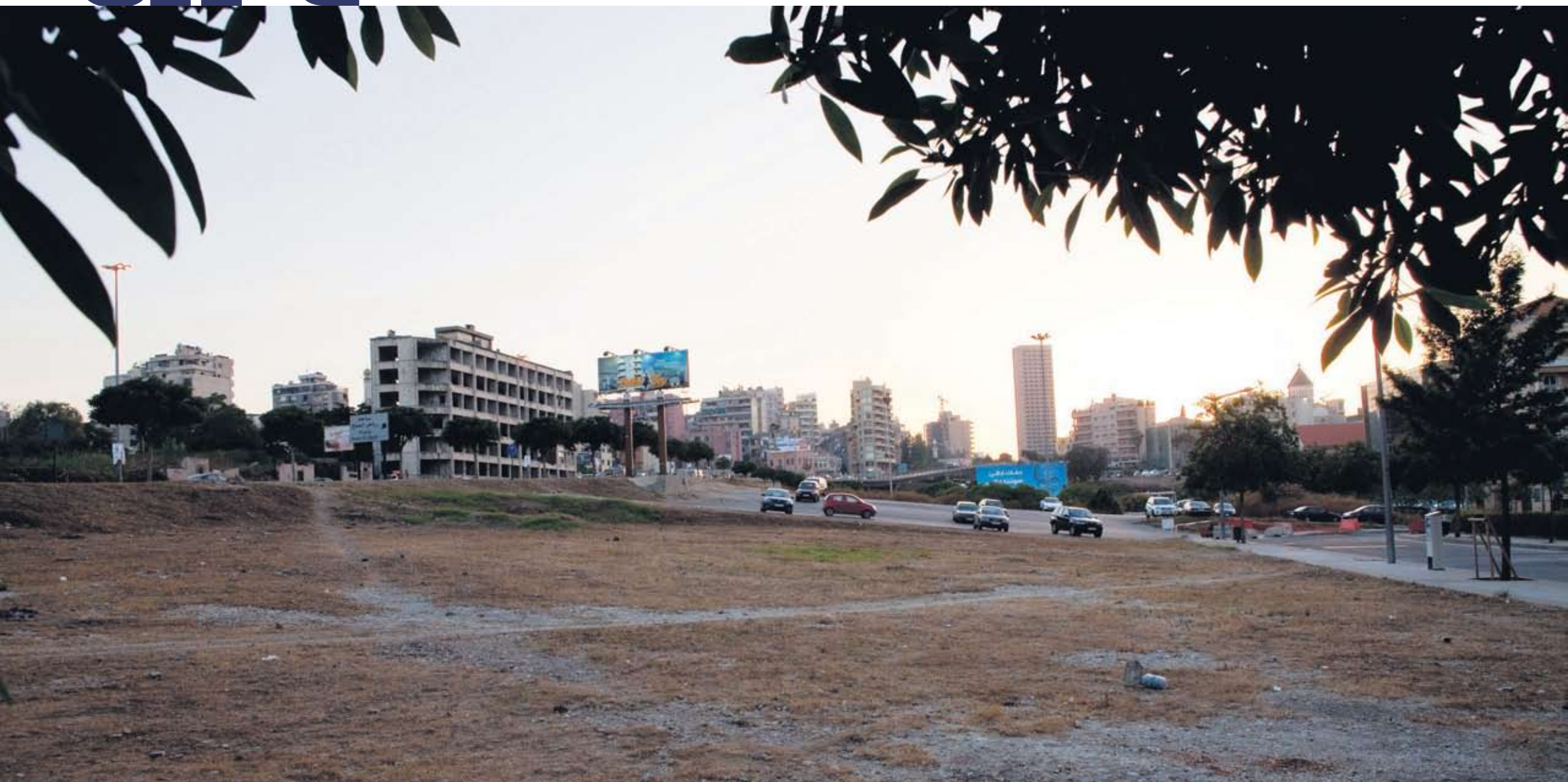
The present state of Plot 128-4, a humble 4,000 square metre patch of unoccupied land in downtown Beirut that will someday be the site of the Omani-funded House of Arts and Culture.