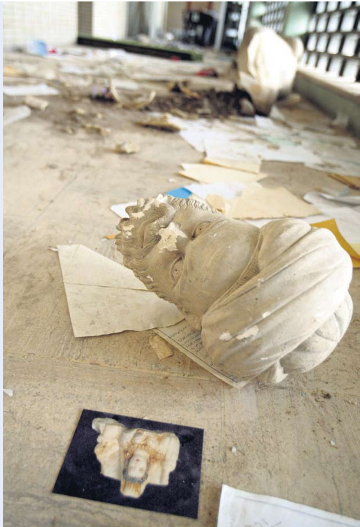
The three-day-long plunder of Baghdad's Iraq Museum resulted in the theft of some 15,000 objects.