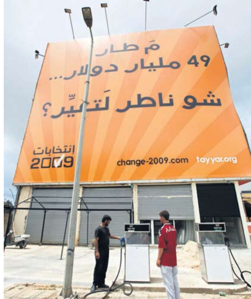
An FPM billboard in Beirut reads “49 billion dollars have disappeared”, a reference to the state's massive public debt.