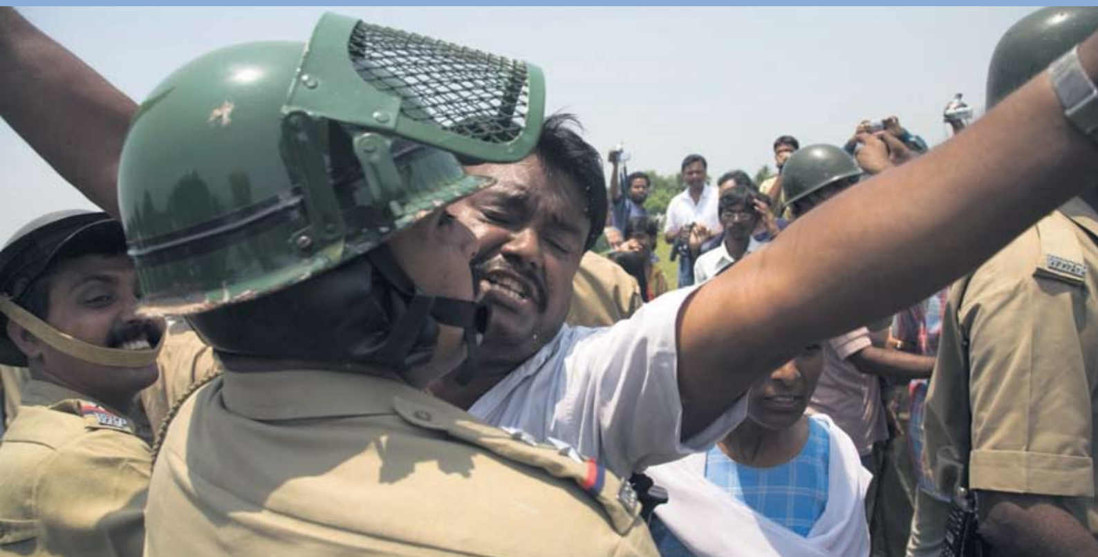
Farmers and villagers clash with West Bengal police after the forced confiscation of land intended to house a Tata Motors plant in 2007.